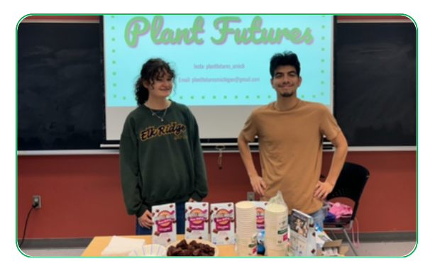
PIZZA KICKOFF @ UT Austin